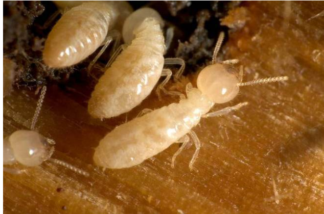
Termites are small and very destructive! (Picture not to scale)