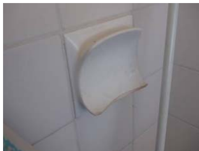
This broken soap dish in the shower could cause injury and needs to be replaced.