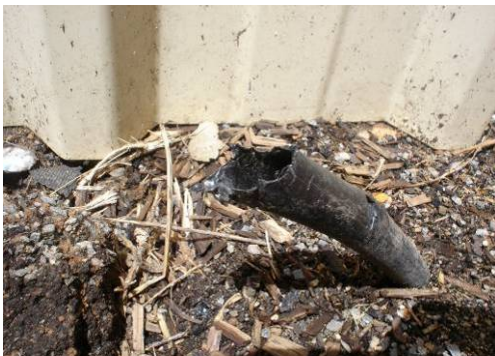
Irrigation and lawn damage caused by a pet

Failure to comply with these terms shall give the owner the right to revoke permission to keep the pet, and is also grounds for further action and possible eviction action.