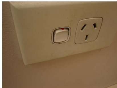
A loose switch to a power point needs repair as soon as possible